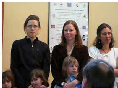
Parents and their children participate in RE Appreciation service. From left: [...]. Foreground: [...].