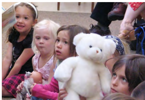
Kids and a companion take in a Sunday morning children's story.