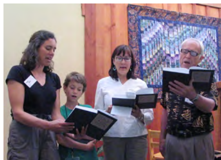
[...] sing in the choir.